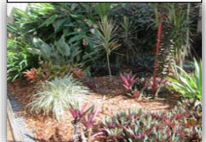
Tenant gardens at Rose Street, Westcourt

To those tenants who create or look after their gardens, a big THANK YOU. You are contributing to making a pleasant place for you and your neighbours to live.