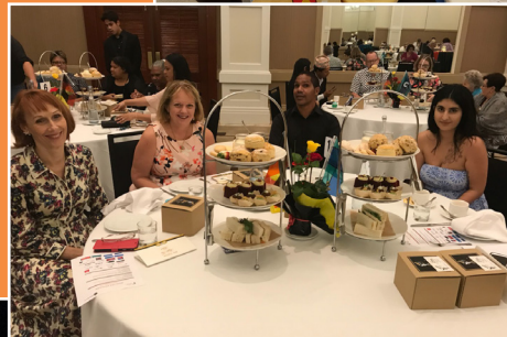
NAIDOC High Tea Event